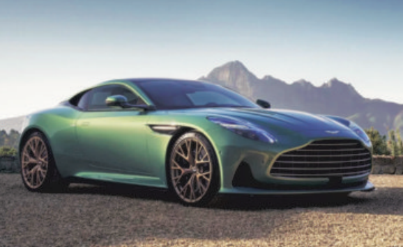
British luxury sports car manufacturer Aston Martin also revealed its plans last year to open a new dealership in South India, aiming to double its Indian market sales